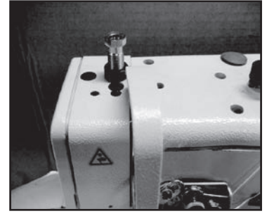
Pressure force can be adjusted simply and certainly with thumb screw at top.